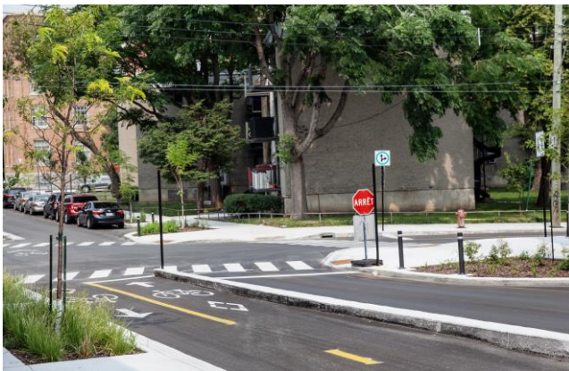
Rue Rose-de-Lima, at the corner of Rue Workman