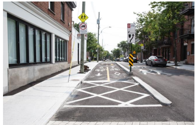
Rue Rose-de-Lima, at the corner of Rue Notre-Dame Ouest